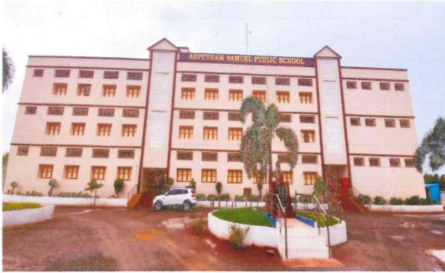
Photos showing the Arputham Samuel Public School, S.no.615/3A, Samugarengapuram – Radhapuram Road, Samugarengapuram Village & Panchayat, Radhapuram Taluk, Tirunelveli District